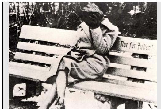
Photo of a Jewish woman sitting on a bench marked “For Jews Only” in Nazi Germany.

In Nazi Germany during the 1930s, Jews were often banned from recreational activities, such as ice skating, swimming and even sitting on certain benches in public parks. Antisemitic signs, such as “Dogs and Jews Are Not Allowed” or “Jews Are Unwelcome Here,” could be seen all over Germany.