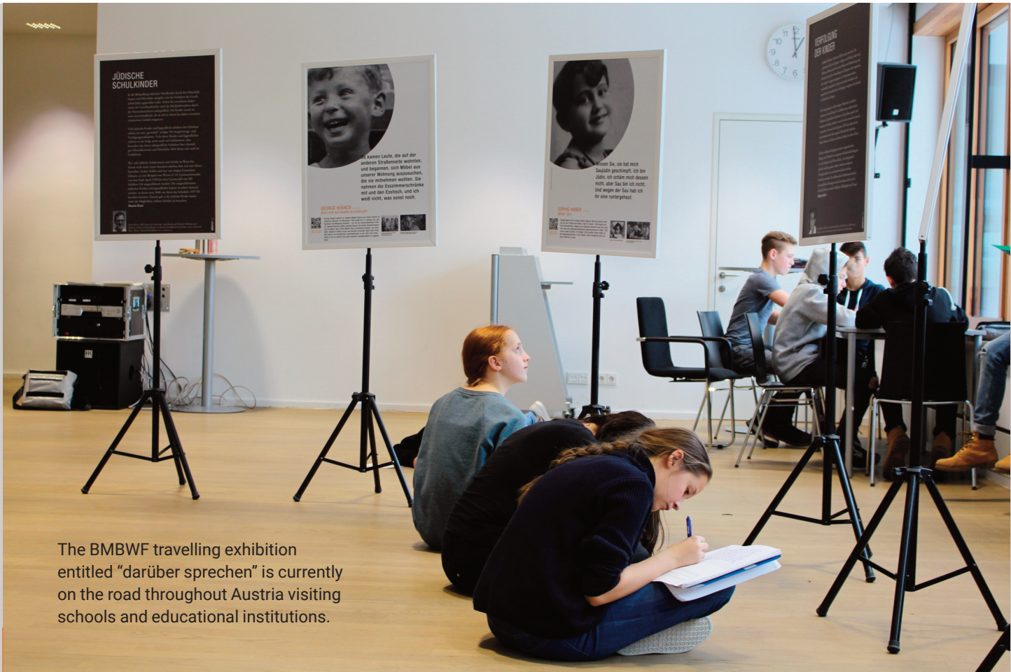
The BMBWF travelling exhibition entitled “darüber sprechen” is currently on the road throughout Austria visiting schools and educational institutions.